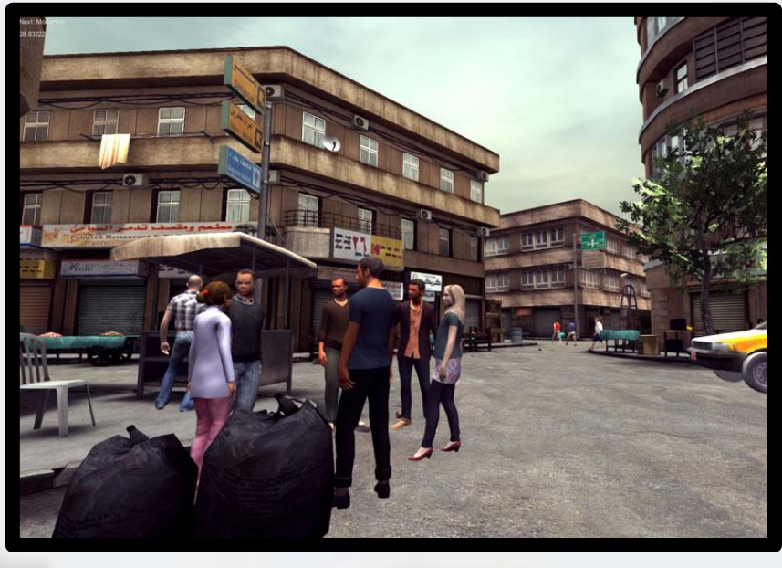
Screenshot from Proiect Sv

Image Credits Figure 1: Project Syria Screenshot [Online Image]. (2016). Retrieved on April 12, 2019 from os://emblematicgroup.com/experiences/project-syria/. Copyright 2016 by Emblematic. 'igure 2: Laser Scan of Al-JakMakya Madrasa [Online Image]. (2016). Retrieved on April 12, 2019 from https://www.cyark.org/about/project-anqa-progresses-in-2016. Copyright 2018 by CyArk and partners.