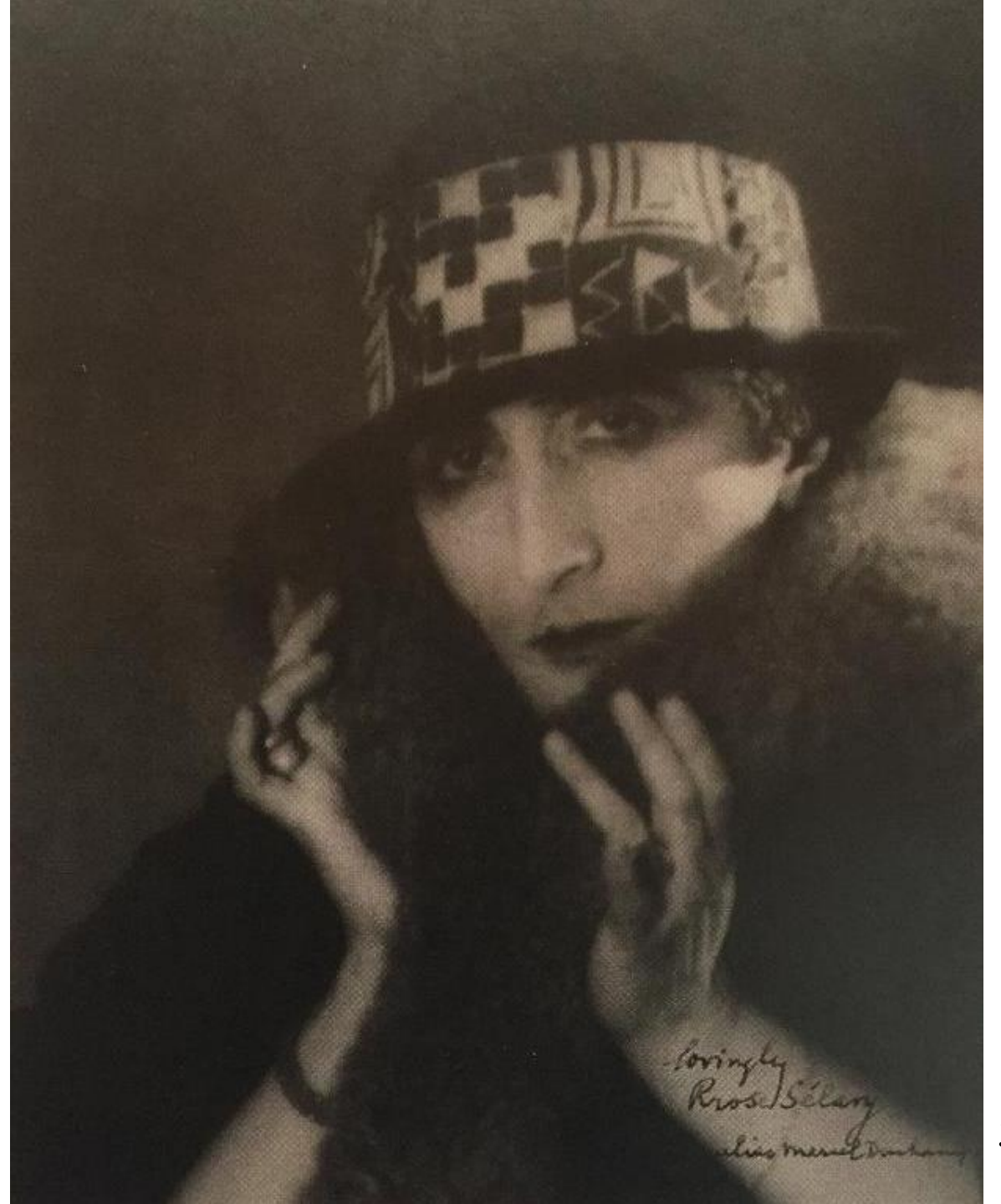
Marcel Duchamp / Rose Sélavy