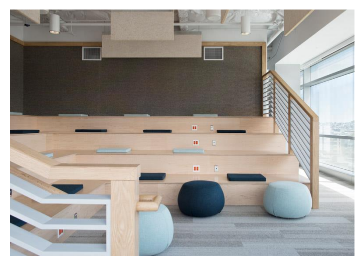
Eventbrite Office, San Francisco