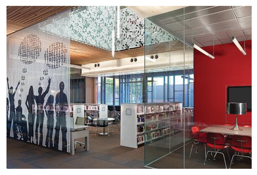
South Mountain Community Library, Phoenix