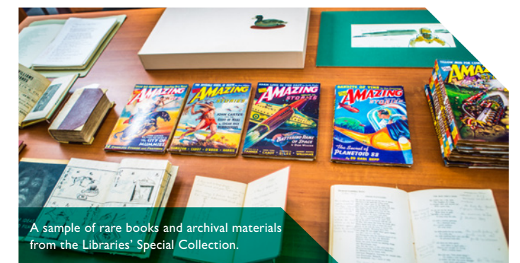
A sample of rare books and archival materials from the Libraries' Special Collection.