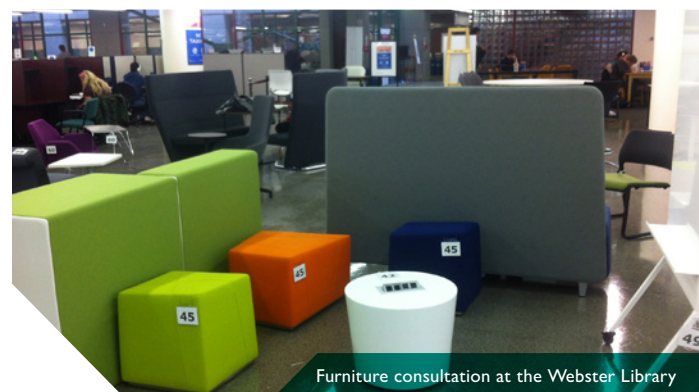
Furniture consultation at the Webster Library