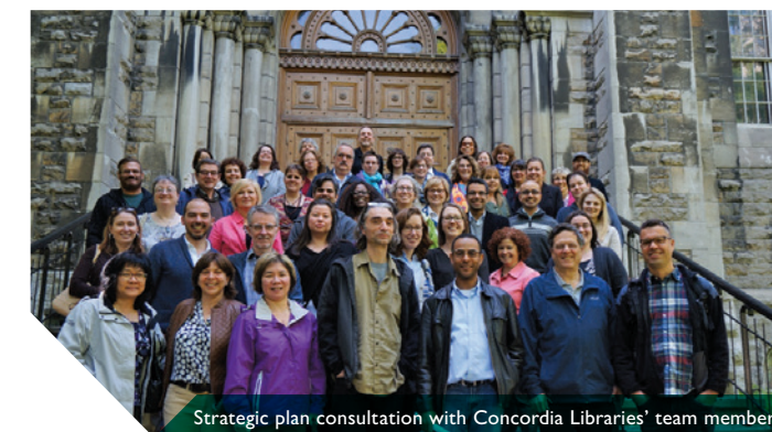
Strategic plan consultation with Concordia Libraries' team members