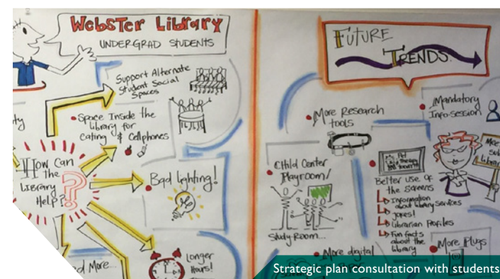
Strategic plan consultation with students