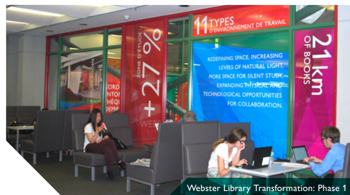
Webster Library Transformation: Phase 1