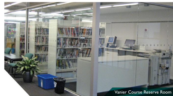
Vanier Course Reserve Room