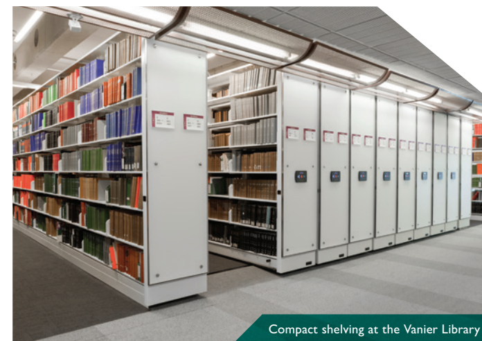
Compact shelving at the Vanier Library