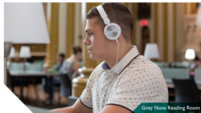
Grey Nuns Reading Room