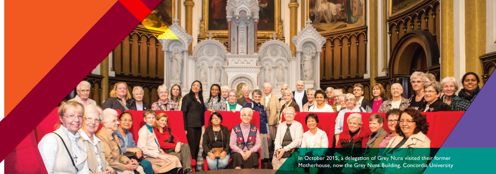
In October 2015, a delegation of Grey Nuns visited their former Motherhouse, now the Grey Nuns Building, Concordia University