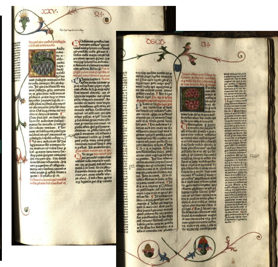
Decretum Gratiani, 1472