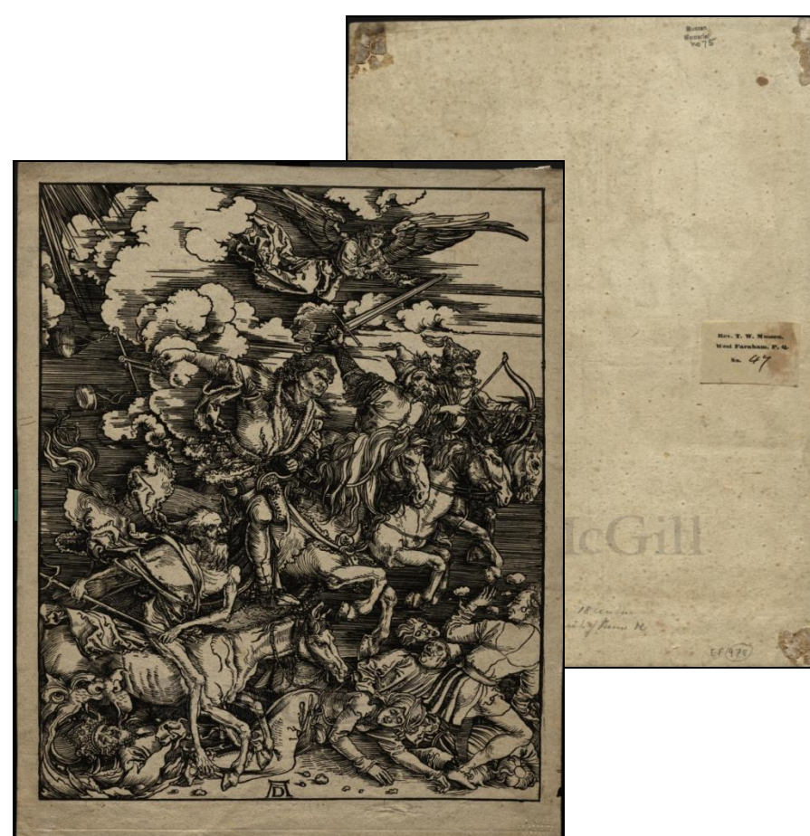
The four horsemen of the Apocalypse, Albrecht Dürer