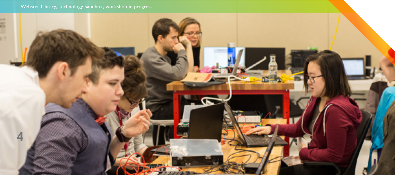
Webster Library, Technology Sandbox, workshop in progress

This past year, Concordia Library expanded its memberships in international organizations by joining IATUL (the International Association of University Libraries) and the Digital Library Federation.