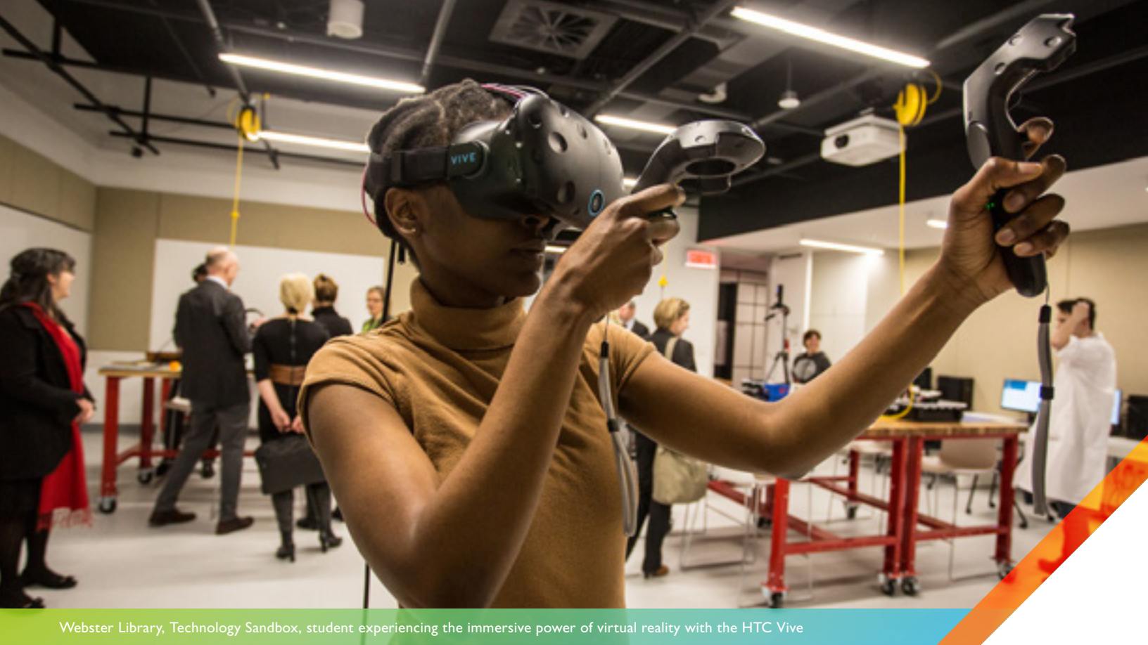
Webster Library, Technology Sandbox, student experiencing the immersive power of virtual reality with the HTC Vive

On May 4, 2018 the Library held an event to celebrate of the one-year anniversary of the Technology Sandbox. This celebration provided us with an opportunity to reflect on our success and celebrate with our community. We were also able to gather some data from our community about what is working well and what Sandbox users would like to see in the future. Volunteers, regular users, and other interested community members as well as staff who had been very involved with the project attended the event. The